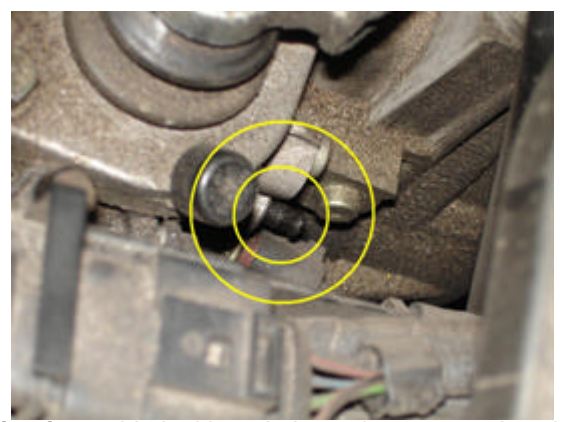
(For MK5 applications, this locking pin is not incorporated on the transmission casing so the linkage will need to be kept in its normal neutral position.)

This pin will need to be pushed in locking the linkage in place. Pushing in the pin and moving the linkage up and down simultaneously, you will feel the pin slide into a slot on the selector shaft once engaged and the linkage will then fail to pop back up to its normal neutral position.