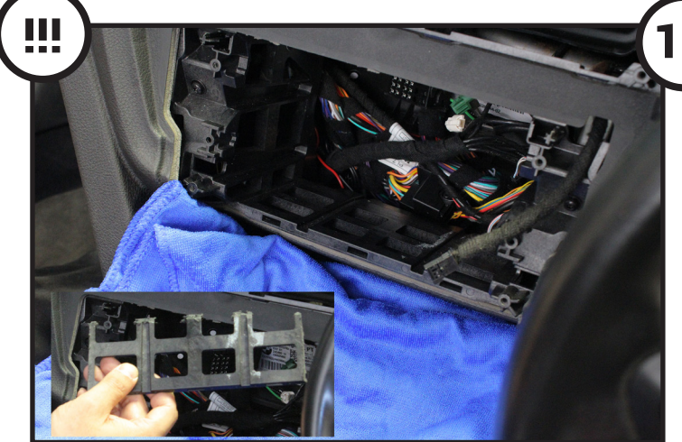
Use a cutting tool to remove the gridded plastic shelf from the bottom of the head unit cavity. See above image to see removed piece (bottom left) as well as the cavity post-modification.