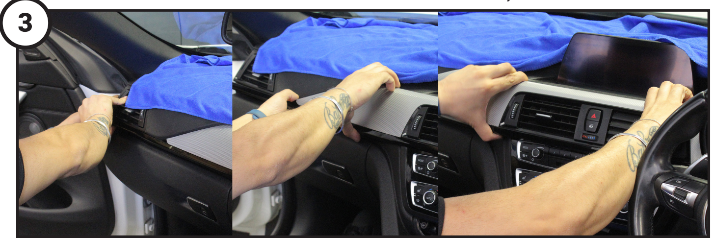
Use a panel removal tool to partially remove the air vent panel/vents, starting from the left hand side of the dashboard and moving to the centre