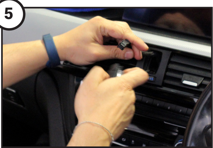
hazard warning button out. Disconnect the button and fully remove the air vent panel/vents