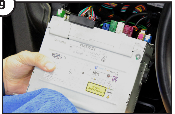
Remove the OEM head unit and disconnect all wiring to the unit. At this stage, the OEM head unit should be relocated into a suitable location at the rear of the vehicle.