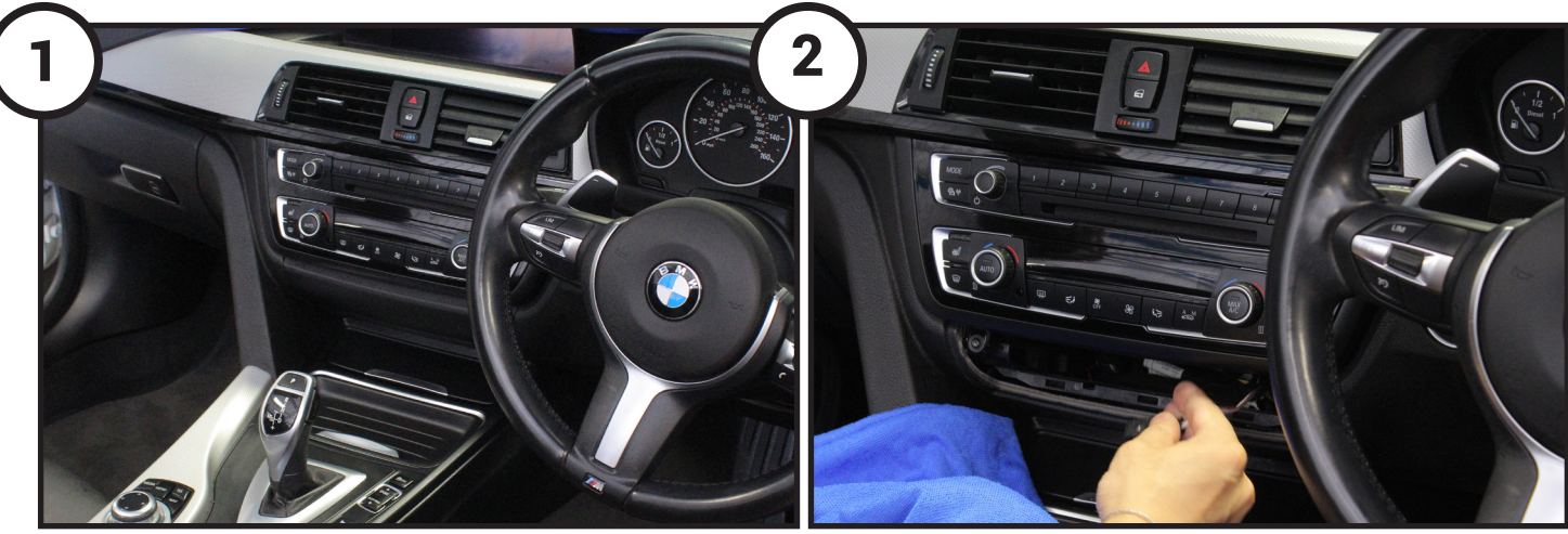
BMW 4 Series OEM Dashboard