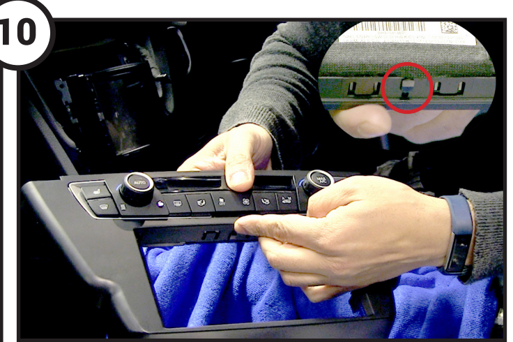
Relocate the climate control button panel into the new double DIN fascia panel, ensuring that the middle clip is lined up for a perfect fit

Need help? Visit support.connects2.com/tickets/technical