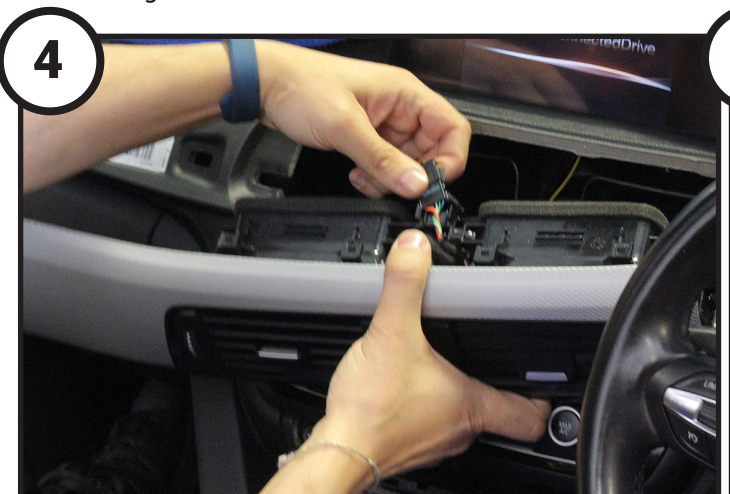
Once the vent panel is loose, pull it out of the dash enough Push the vent panel back into the dash and push the to disconnect the cable at the back of the panel