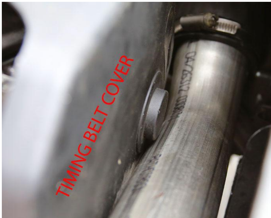
Driver side Bi-Pipe Installed

Make sure you have your 90 degree diverter valve hoses installed on the new bi-pipes, and then clamp the bi-pipe securely at the throttle body boot once it is clamped at the intercooler hose. As always, make sure the clamping surfaces of the bi-pipe are 100% clean of any oils or residue, as well as being full seated into your throttle body boot. The passenger side pipe installs in the same fashion as the driver side but there is no worry of clearing fan blades.