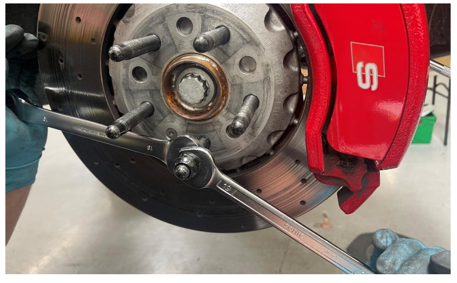
Step 10 Remove the lug nuts.

Use (2x) 19mm wrenches to break the lug nuts apart.