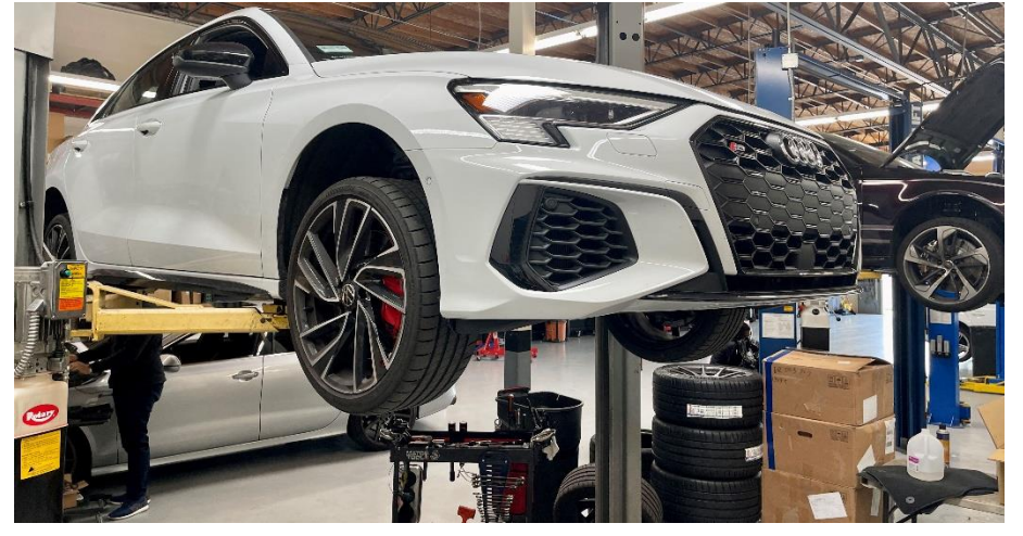
Step 2 Remove the wheels.