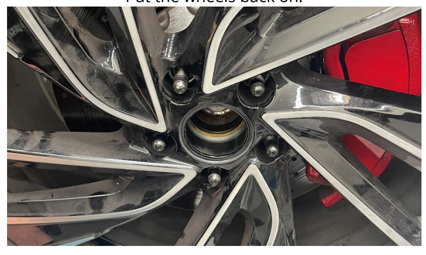
Step 13 Install the lug nuts and you are done!