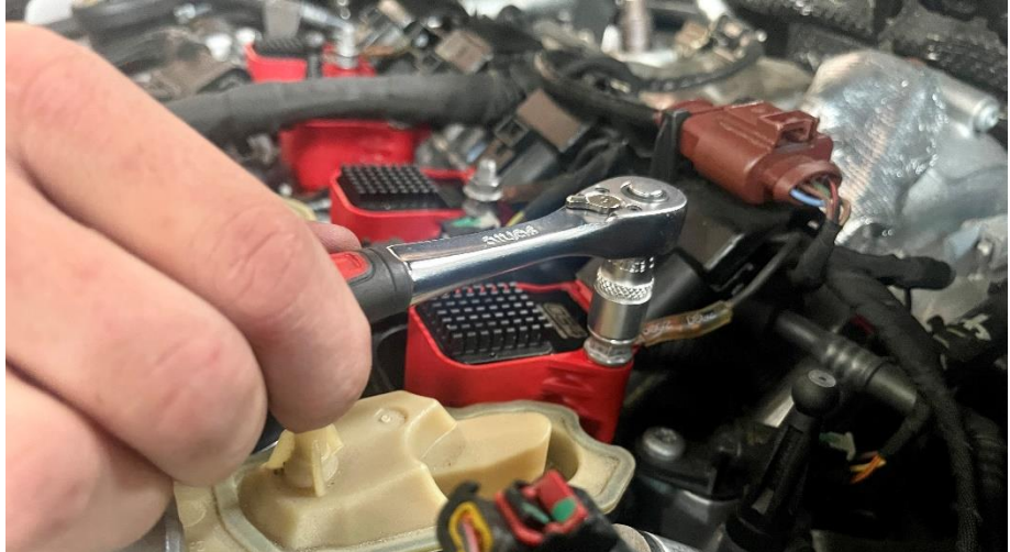
Step 13 Reinstall the PCV pressure sensor.

Install the ground straps to each stud and secure them with the factory nuts with a 10mm socket.