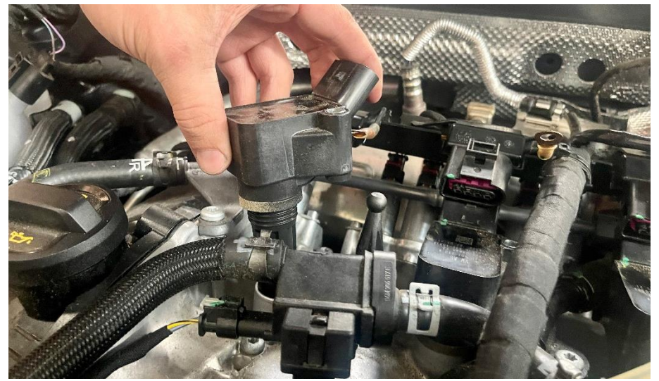
Step 9 Install the 034 ignition coils.

Carefully remove the coils by pulling up on them.