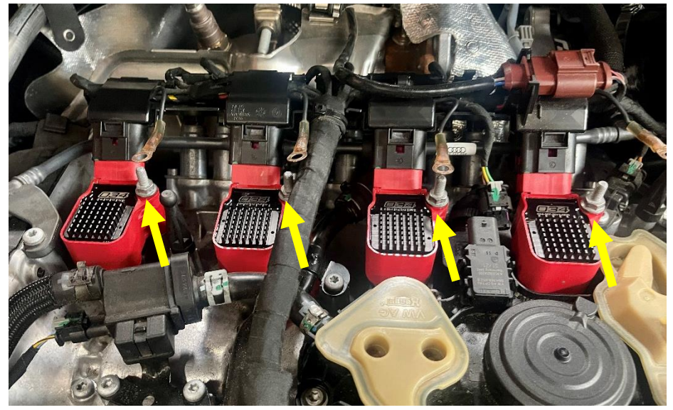
Step 11 Install the coil harness connectors to the coils.

Secure the coils to the valve cover with the factory studs.