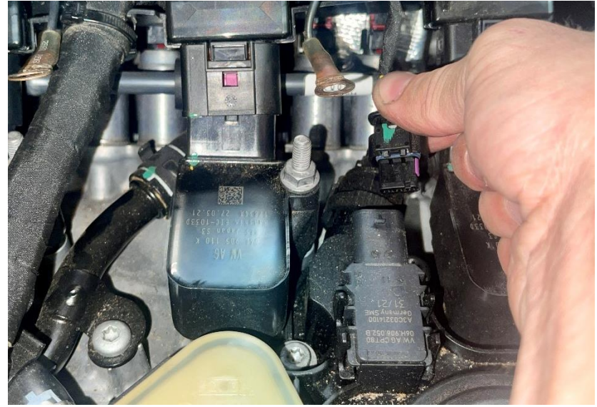
Step 7 Using a 10mm socket, remove the stud securing the coils to the valve cover.

Carefully disconnect the coil harness plugs from the coils.